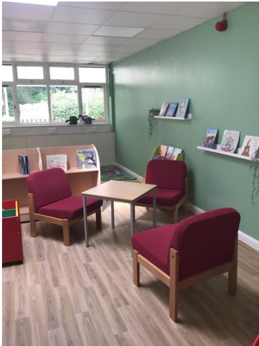
The Early Years library area.