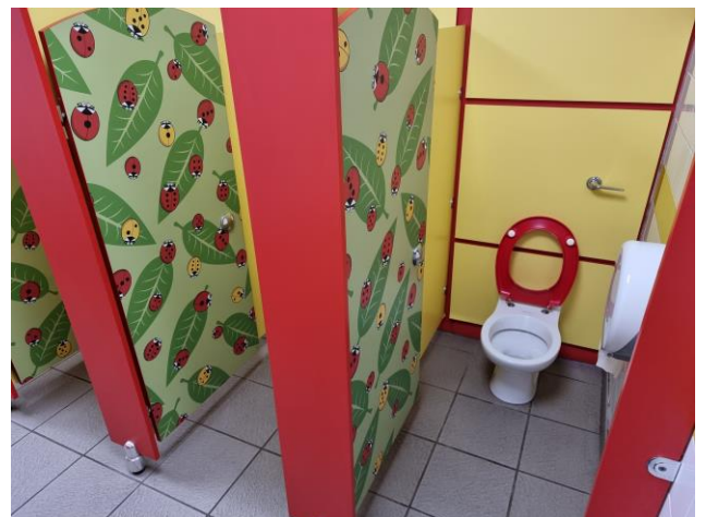
These are the Reception toilets.