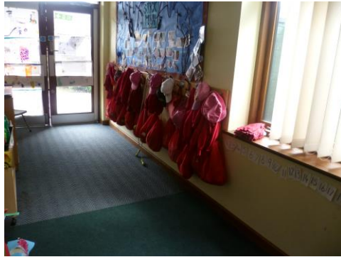
This is where the children hang their coats and PE bags.