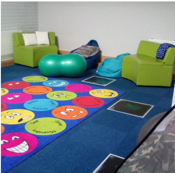
This is our nurture room.