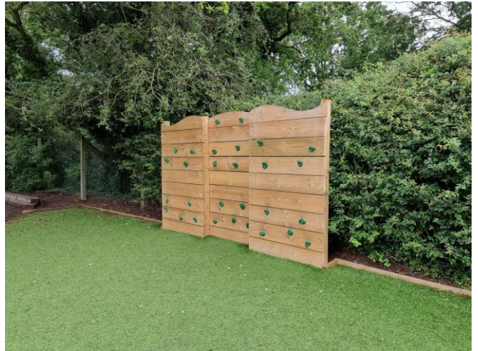
These are pictures of the outside areas