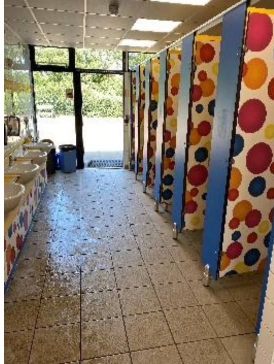
These are the toilets children will use off the Year 4/5 corridor.