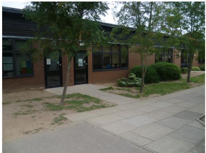
Entrances to 5AN and 5C