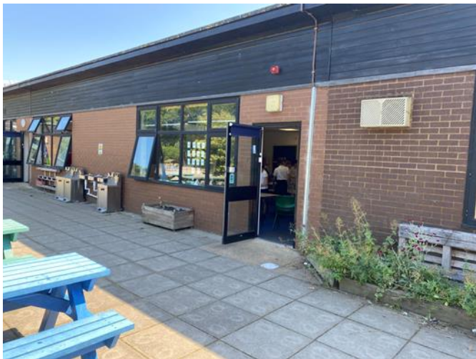
Entrance to 5JA.