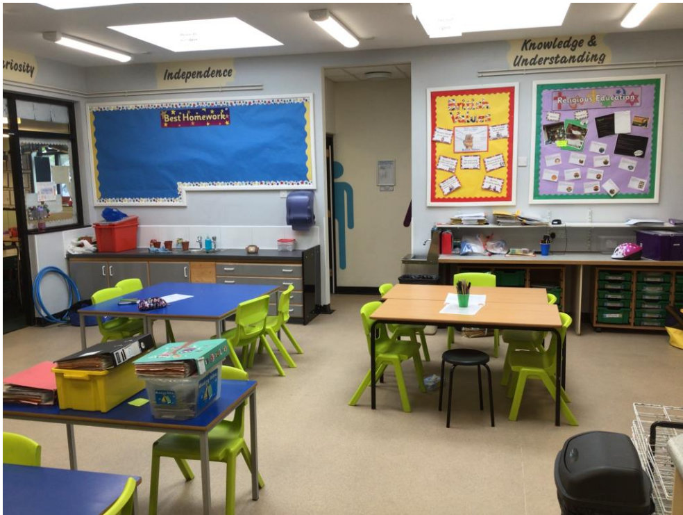
This is the year 2/3 shared area.