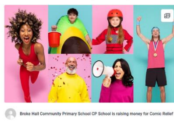
Broke Hall Community Primary School's fundraiser for Comic Relief

Broke Hall School's Fundraiser for Comic Relief