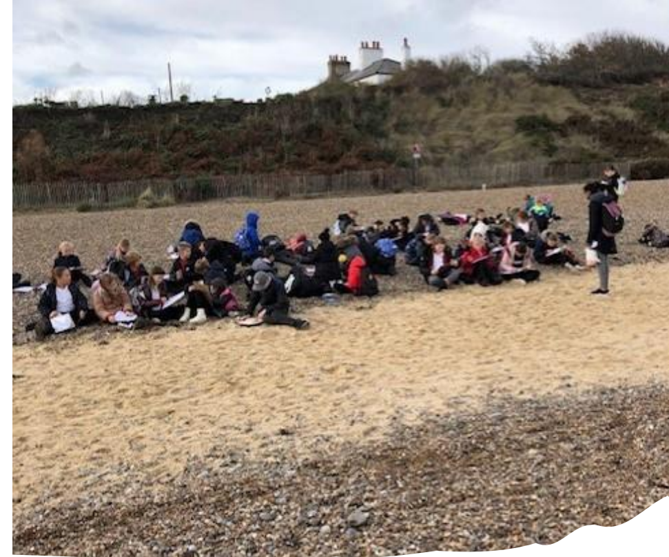
Year 5 trip to Dunwich museum and beach