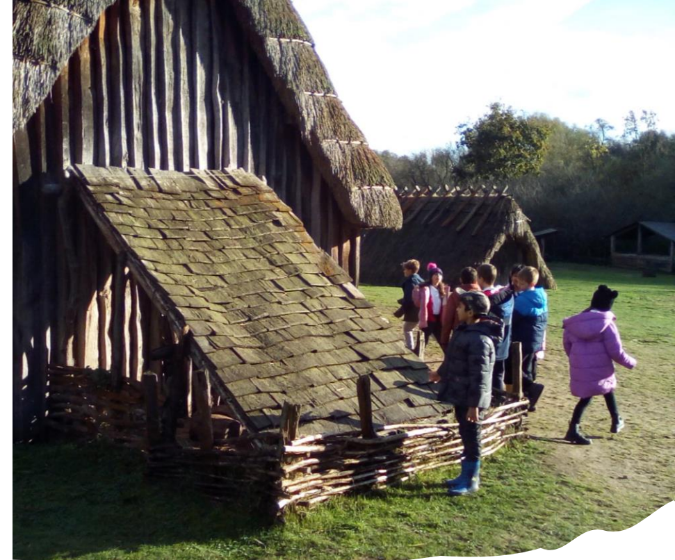
Year 4 visit West Stow